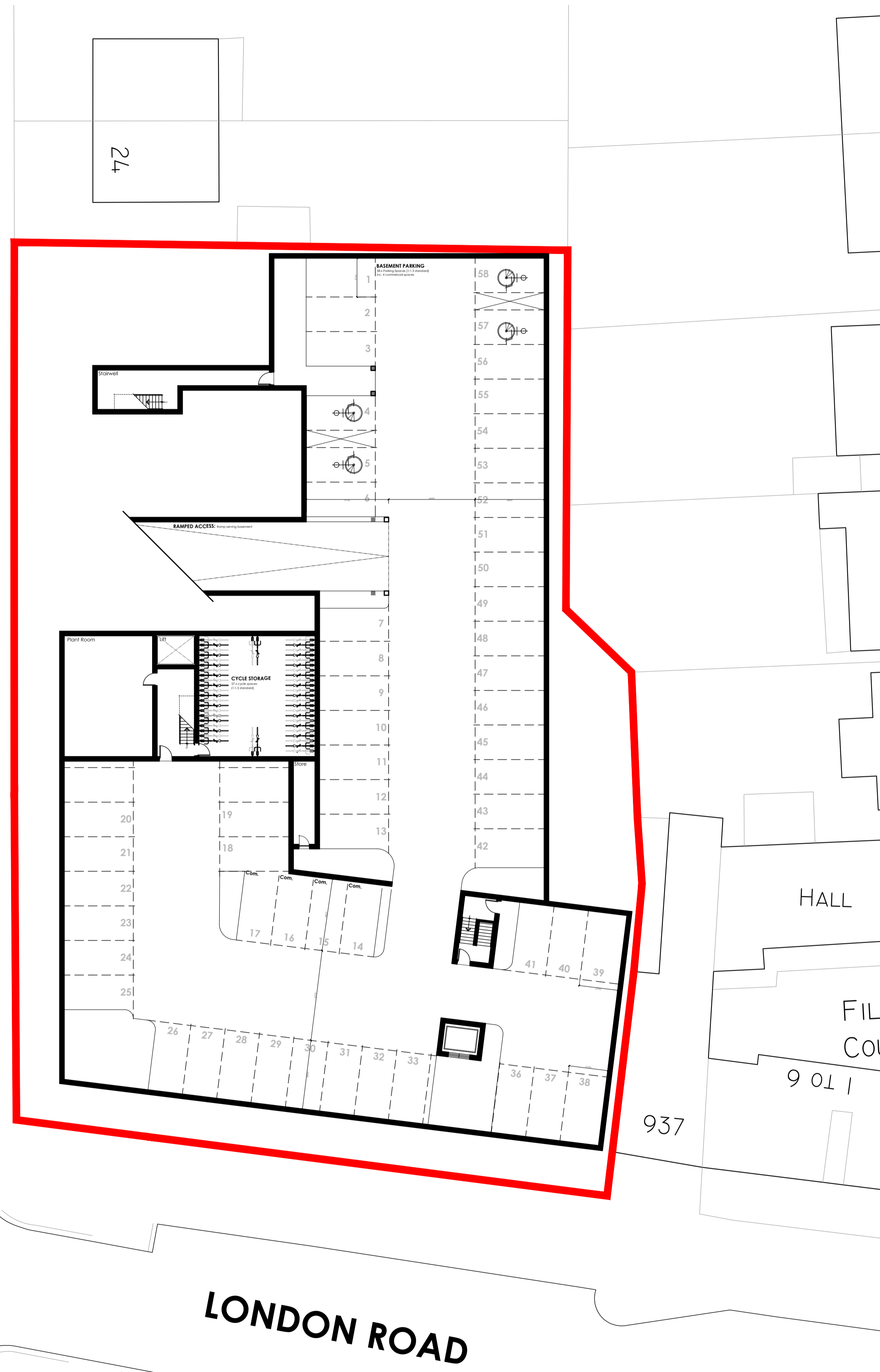
PROPOSED BASEMENT PLAN SCALE: 1:200@A1